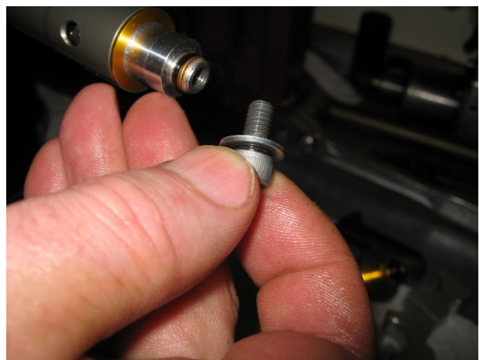
Remove the 6 mm socket head cap screw and washer from bottom end of cartridge and set aside.