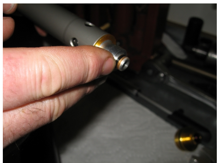
Make sure the adaptor has the 6 x 1.5 mm o-ring installed, an extra was supplied in the cartridge if damaged or needed for future reassembly.