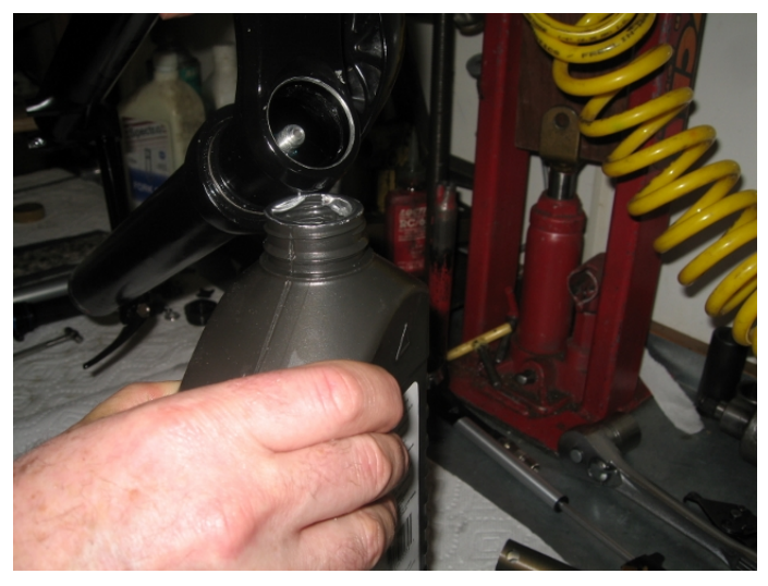
level to 35 mm from the top.